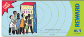
Part Number: 3639