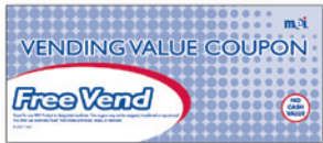
Part Number: 2629

Generic coupons from MEI are a great way to “get your feet wet” with your coupon program. We offer 11 eye-catching designs that are ready to order and use. With the touch of one button you can program your MEI CASHFLOW validators for coupon use — cashing in on sales.