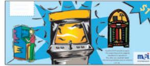
Part Number: 3637