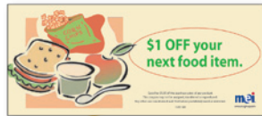
Part Number: 3633