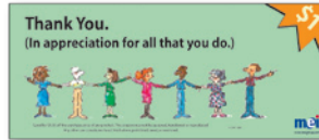
Part Number: 3638