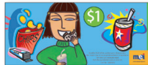
Part Number: 3635