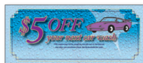
Part Number: 3616

Information on compatibility with older model validators can found on the MEI website.