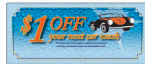
Part Number: 3617