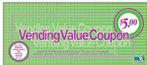
Part Number: 3468