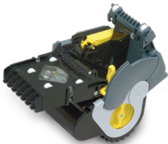
MEI CASHFLOW ® VNR Vending Recycler

High-Visibility Bezel option strokes through a wide range of colors