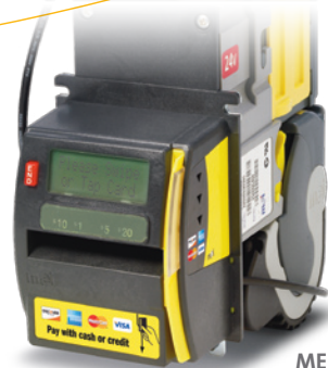
MEI CASHFLOW 3-in-1 bezel for recyclers