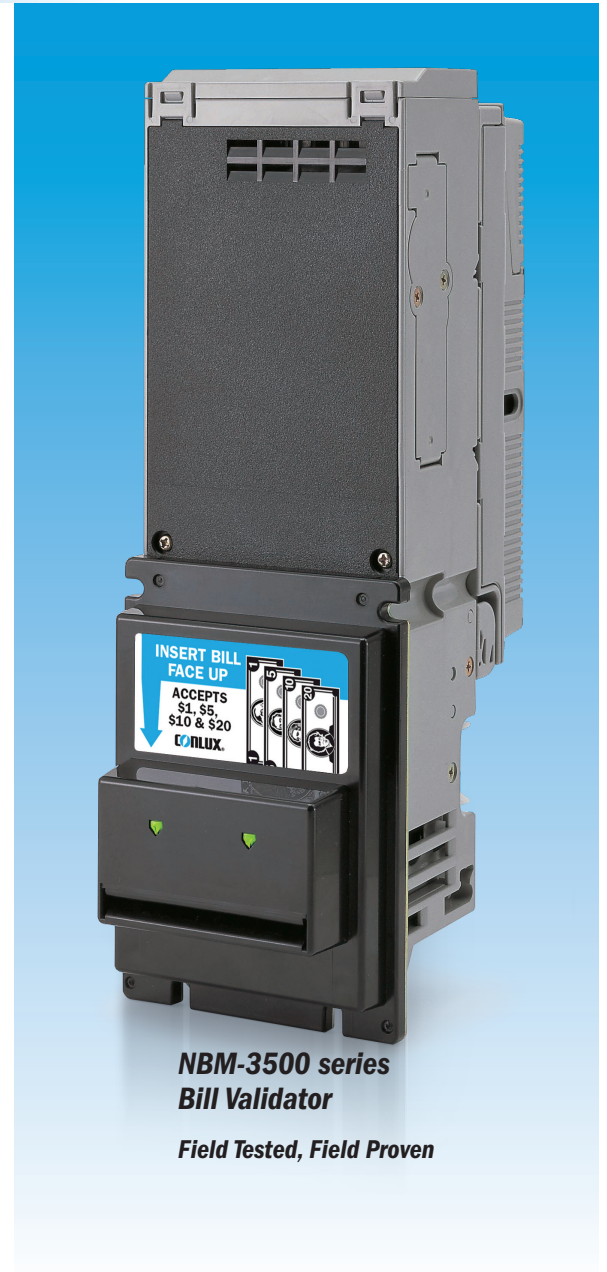
NBM-3500 series Bill Validator