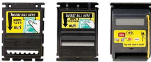
Armored Bezel Downstacker Bezel 4-in-1 Bezel *Additional bezel options available

The AE Series has an extensive portfolio of bezels to meet your machine needs and types. This includes an armored bezel that stands up to harsh treatment and break-ins, and the CASHFLOW 4-in-1 bezel that accepts cash, cards, coupons and contactless payment. The new clear bezel option will add a unique and modern look to your machines.