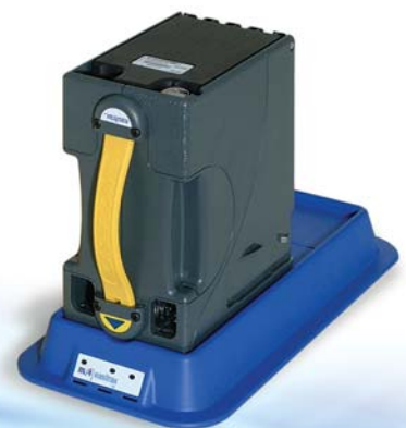
MEI EASITRAX® Reader Base