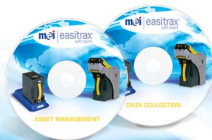
MEI EASITRAX® Software