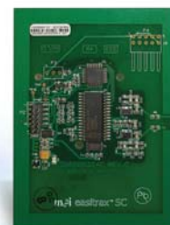
MEI EASITRAX® Antenna Board