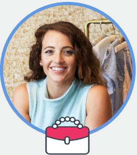
Fashion & Apparel